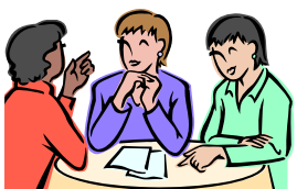
FAAVCO strictly busi- ness

It has come to mind that our organization by laws have to be revised, The board have selected a committee to study this change. I would like to personally invite each member to participate in our monthly meeting. We need to hear you out guys! All comments are welcome. Our organization is growing and it's vital that each members actively engage in our activities. Please everyone its only once a month and its held on the first Saturday of the month at 7pm at the Port Orange Adult Community Center. Our meeting is fun and you know we Fiiipino's always like to eat, so bring your favorite dish!