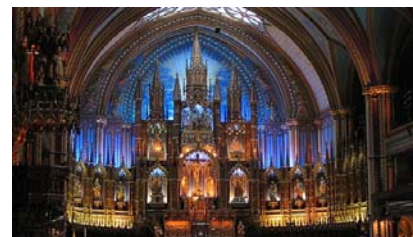
Notre Dame Cathedral, Montreal

The first Tagalog version of the Canadian Charter of Rights and Freedoms was unveiled in Canada on May 29, 2007. This momentous occasion which underlines the immense contribution of the Filipino Canadians have made to Canadian history. This is a great achievement for all Filipinos living in Canada.